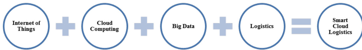
Figure2. Smart logistics structure